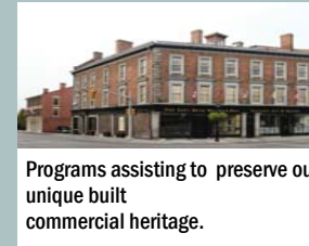
Programs assisting to preserve our unique built commercial heritage.

This objective is shared by many building owners in the Municipality and partners such as the Architectural Conservancy of Ontario, Port Hope Branch.