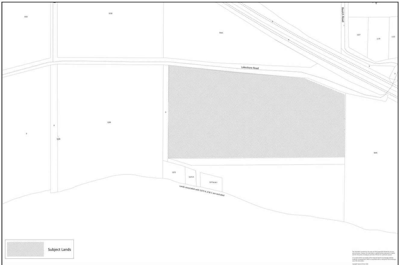
Figure 1: Subject Lands Map

Sagar Babbar, MA Planner Email: sbabbar@porthope.ca Tel: 905-885-243, ext. 2506 Toll Free: 1 855 238 0948